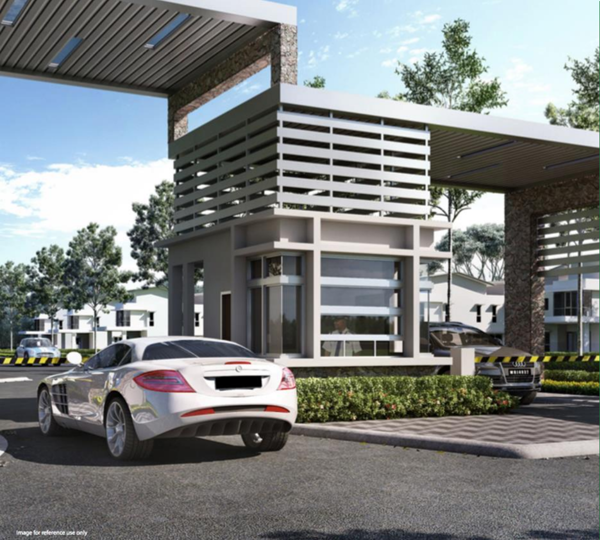
Image for reference use only